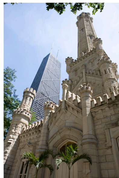
Now functionally obsolete, the Chicago Water Tower now houses a visitor information center and has become one of the major tourist attractions in Chicago.

For more information visit: www.choosechicago.com