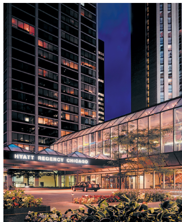
Hyatt Regency Chicago

The Fairmont Chicago 200 North Columbus Drive Chicago, IL 60601 Telephone: (312) 565-8000 Fax: (312) 856-1032 Group Rate: $175 single/double Parking: Overnight - $49