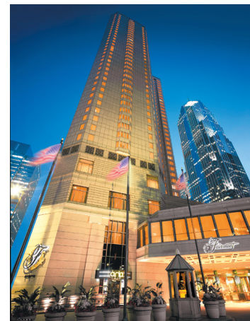
The Fairmont Chicago

Once you are registered for the meeting you will receive instructions on how to make your hotel reservation. Therefore, you must register for the meeting prior to reserving your hotel room. You will not receive the group rate if you contact either hotel directly.